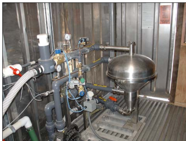
Figure 2. CFT Turboclone™ filter installed as prefilter to ultrafiltration.

Within two months of BVWD commitment, CFT installed a customized, self-contained mobile pilot unit with the proposed equipment (Figure 2).